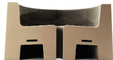
Figure 2 – Multiplo . Hey Team, 2010. Italia. Modular, reconfigurable and multifunctional solution (left)