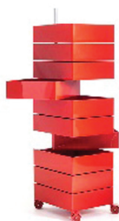
Figure 9 – 360 Container . Konstantin Grcic, Magis, Italy. A storage device that has a set of drawers joined by a pivot aluminium pole. Each drawer can independently swivel, in order for all contents to be accessed easily (left)