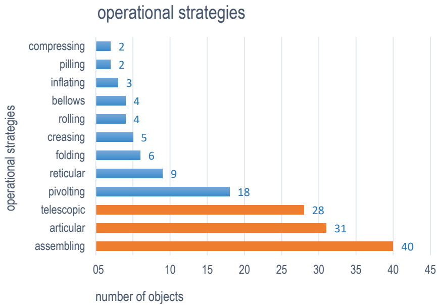
Figure 5 – Operational strategies in the sample

are assembled and disassembled in order to assume different configurations, according to the user's needs (figure 6).