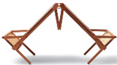
Figure 6 – Tandem . Emmanuele Magini, Campeggi, Italy. This object serves the function of sleeping, receiving guests and eating. The reconfiguration of the proposal is done with the strategy of assembling (upper image)